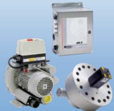
Aerosol Manifold II