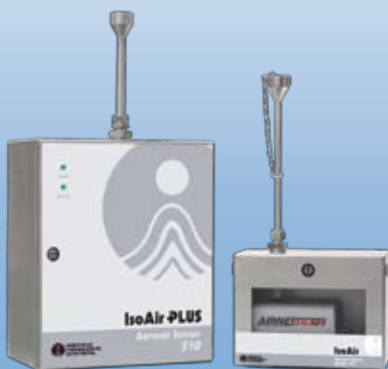
IsoAir® and IsoAir® PLUS