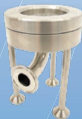
MiniCapt® Monitoring Kit