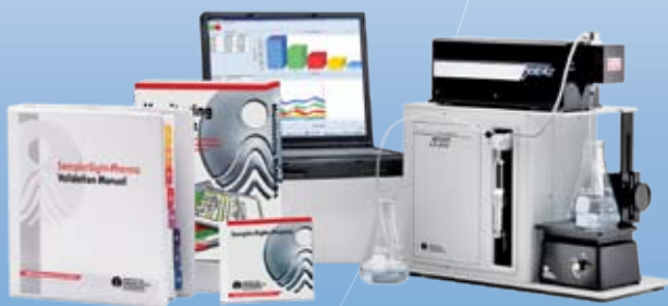
APSS-200 Syringe Sampling System