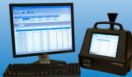
DataAnalyst with Lasair® III