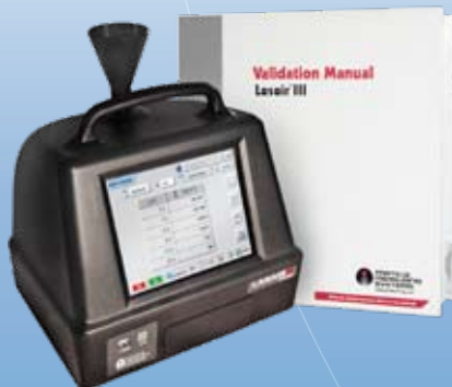
Lasair® III 5100 L/min